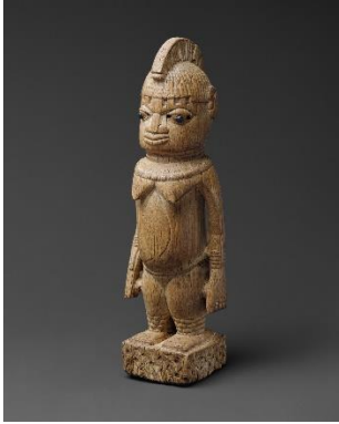
Female Figure // Weibliche Figur , Object No.: 1978.412.302.

Metropolitan Museum of Art, New York, USA