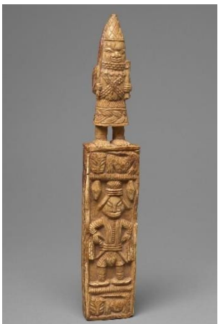
Door bolt // Türbolzen , Inv. No. 64781

https://digitalbenin.org/catalogue/50_VO64799