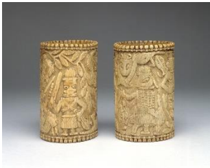
Bracelet: Equestrian and Standing Figure // Armbänder: Reiter und stehende Figur , Object No.: 1991.17.77.

https://digitalbenin.org/catalogue/22_1978412302