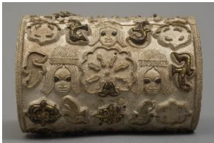
Armcuff // Armspange , Inv. No. LG1948.28.1

https://digitalbenin.org/catalogue/37_LG1954157