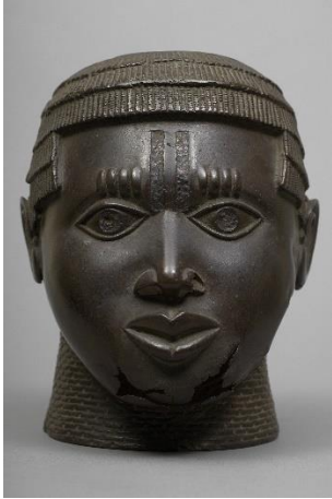
Trophy head // Trophäenkopf , Inv. No. LG 1954.15.7