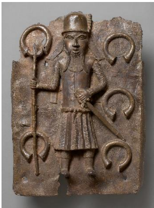
Plaque: Portuguese with Five Manilas // Platte: Portugiese mit fünf Manilas , Inv. No. 94.799

https://digitalbenin.org/catalogue/22_19911777