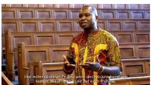
Oral History Interview at the MARKK, 2022.